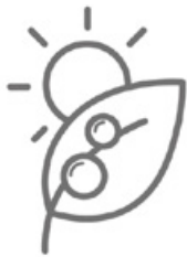
Crop Oil Concentrate