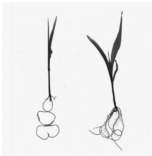
Figure 1. Untreated (left) vs Voyagro (right).