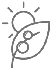
Methylated Soy Oil