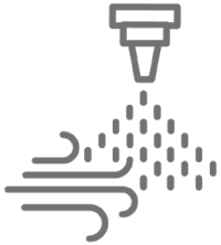
Drift & Deposition Aid