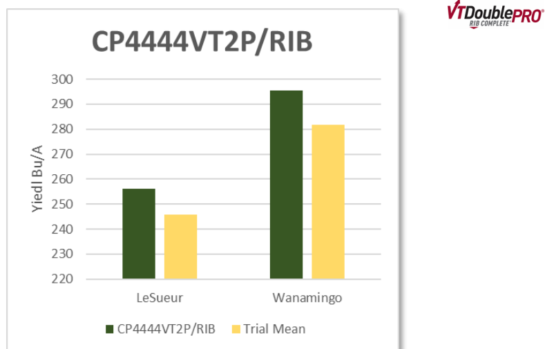
2022 Answer Plot® locations: LeSueur, MN and Wanamingo, MN