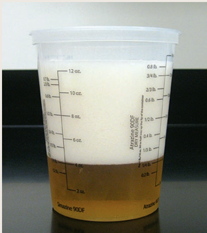
Water + Pesticide